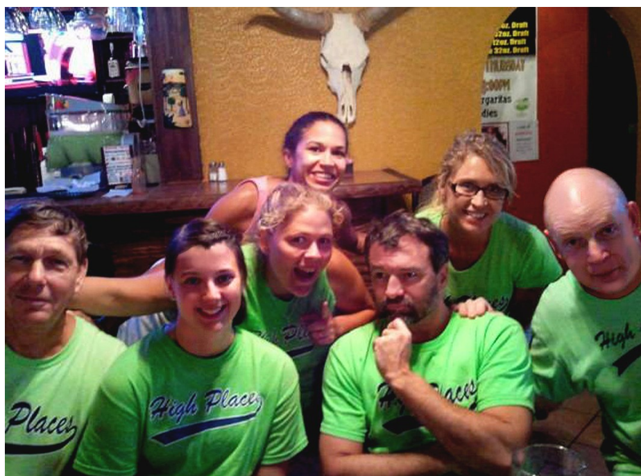
2014 High Places Softball Team ...finishing out a winning season at a local restaurant.